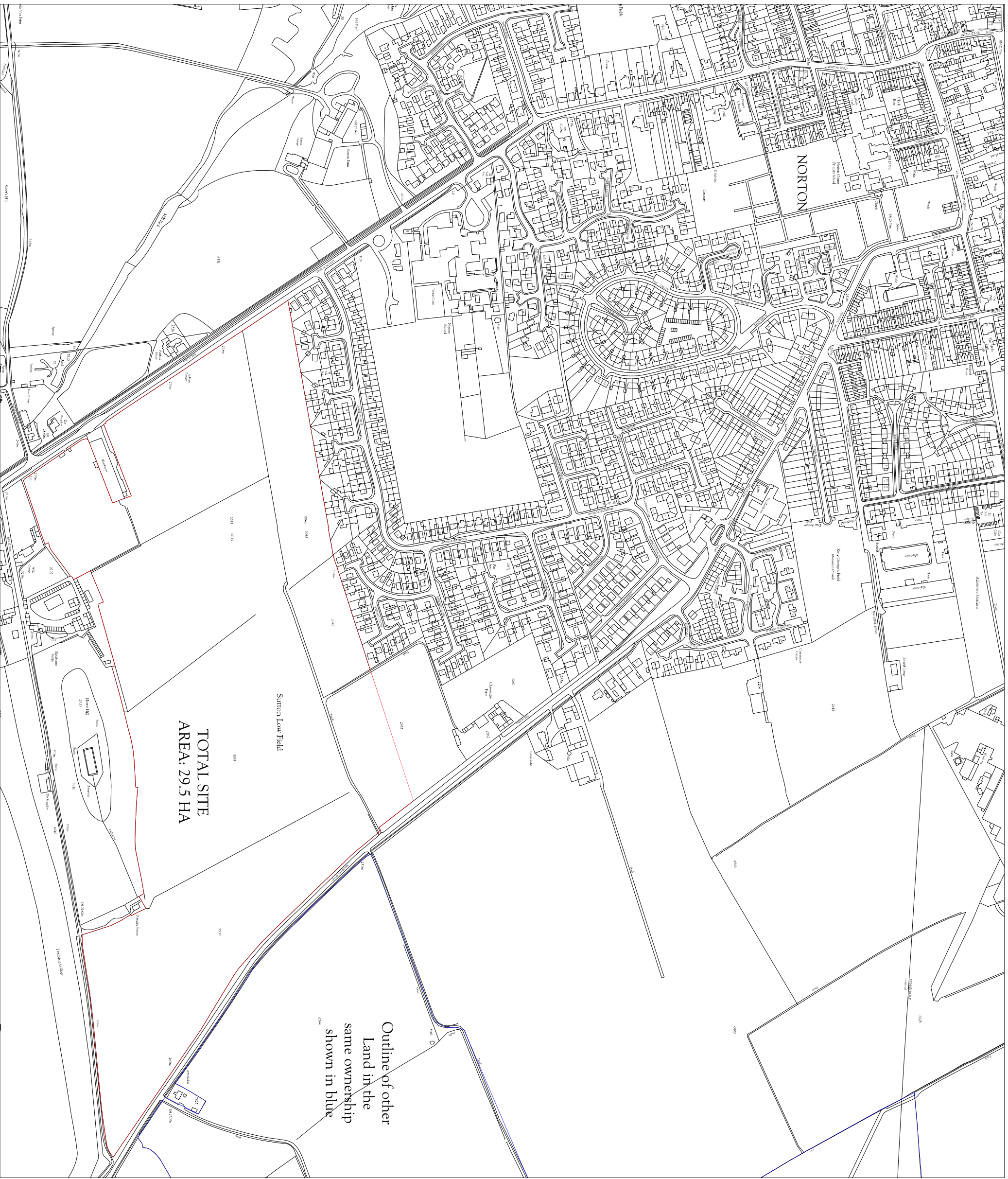
Location Plan - Scale 1/5000

PLEASE NOTE Do not scale any measurements from this drawing. All dimensions for fabrication must be checked on site. Any drawing dimensions must be reported immediately. This drawing is provided for copyright protection only and is not to be reproduced without the written consent of The Planning & Design Partnership Limited. WARNING TO USER (PLANNERS) Errors are warned that this is a working drawing and is not intended to be treated as a definitive material description in relation to any particular property or development, any of the special names prescribed for other trade under the above act. The contents of this drawing may be subject to change without notice. Consequently the layout, form, content and dimensions of the finished construction may differ materially from those shown. Not to the contents of this drawing constitute a contract, part of a contract or a warranty.